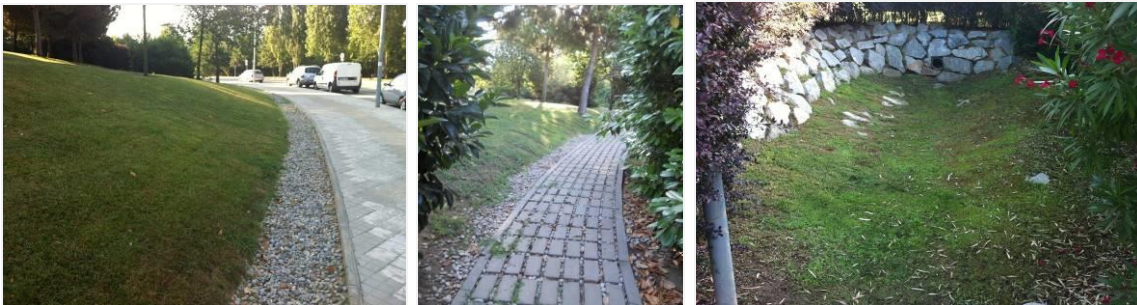
Infiltration trenches, permeable paving and retention and infiltration basin (Parc Can Magí)

Nowadays, there are a several public spaces in Sant Cugat that are examples of good practices in terms of the implementation of sustainable drainage criteria. They are located mainly in gardens and parks ( Can Magí, Víctor Català, Turó de Can Mates, Arboretum, Pollancrea and Central ), at public building surroundings ( Monestir and Poliesportiu Municipal ), or in new urbanisations areas such as Turó de Can Mates .