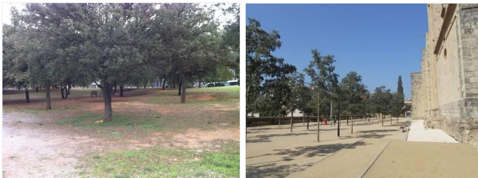
Grass waterway concentrating runoff in the area of influence of trees (Parc de l'Arboretum) and use of pervious pavements that contribute to the infiltration (surroundings of the Monastery)